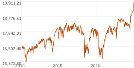
DOW 3 Year