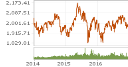
KOSPI 3 Year