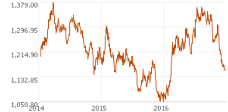
Gold 3 Year