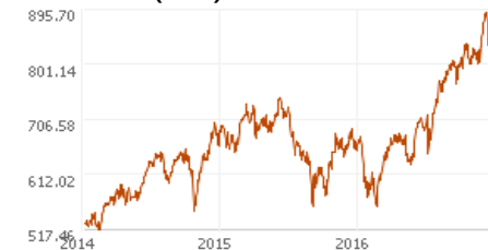
PHLX Semi (SOX) 3 Year