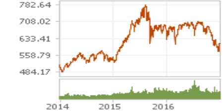
KOSDAQ 3 Year