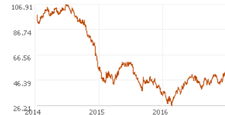
WTI 3 Year