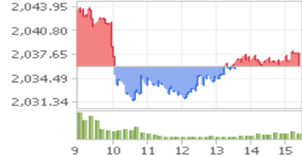
KOSPI 1 Day