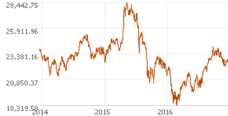
HK HSI 3 Year