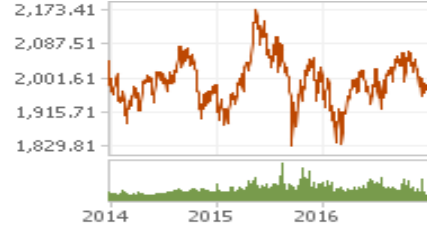
KOSPI 3 Year