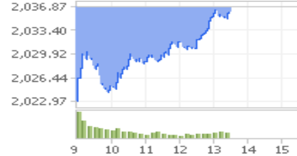
KOSPI 1 Day