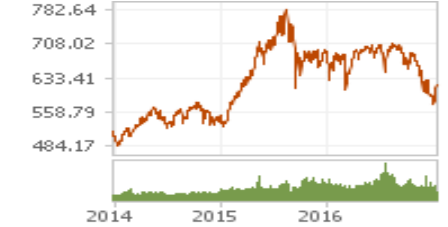
KOSDAQ 3 Year