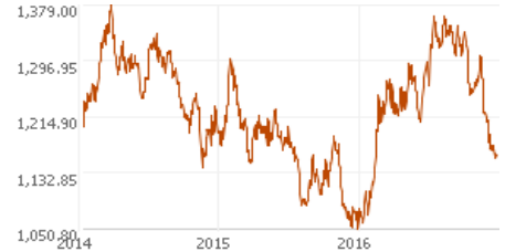
Gold 3 Year