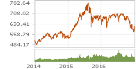
KOSDAQ 3 Year