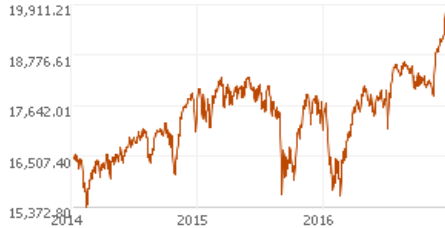
DOW 3 Year