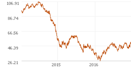
WTI 3 Year