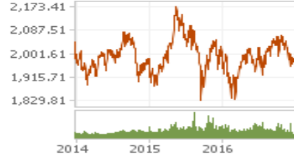
KOSPI 3 Year