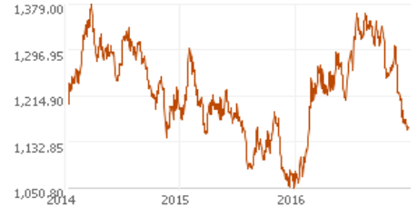
Gold 3 Year