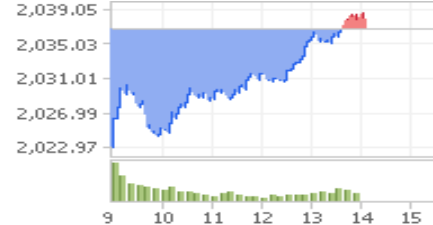
KOSPI 1 Day