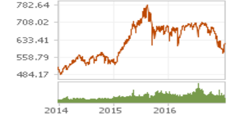
KOSDAQ 3 Year