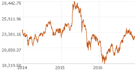
HK HSI 3 Year