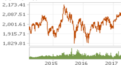
KOSPI 3 Year