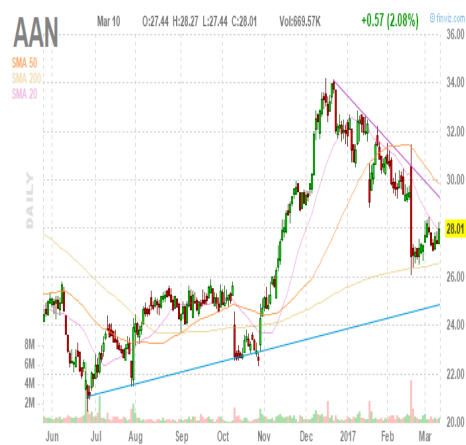
1 Year Chart