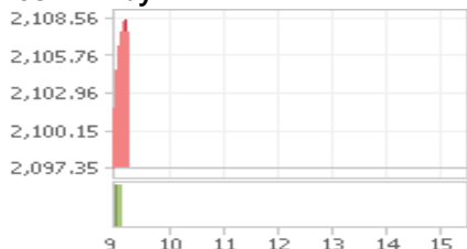
KOSPI 1 Day