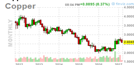
Copper 5 Year