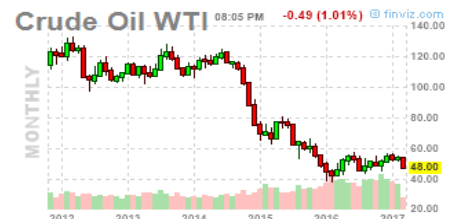
WTI 5 Year