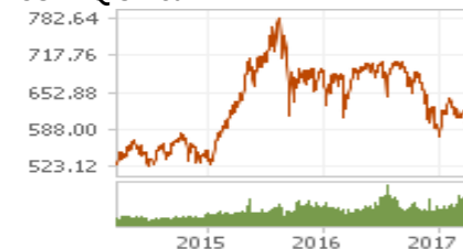
KOSDAQ 3 Year