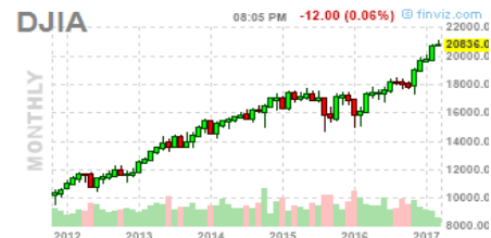
DOW 5 Year