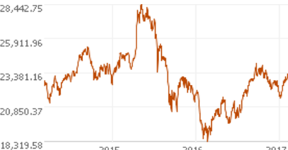
HK HSI 3 Year