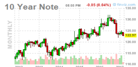
10 Year Note