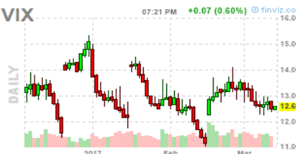
VIX 2 Months