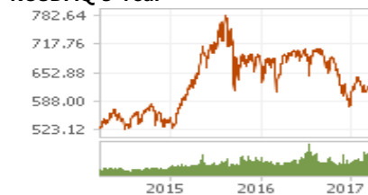
KOSDAQ 3 Year