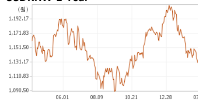
USDKRW 1 Year