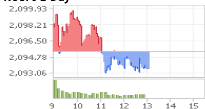
KOSPI 1 Day