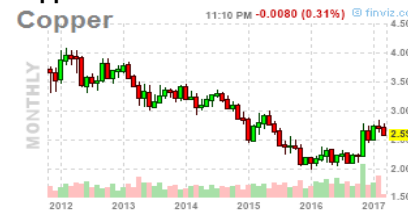
Copper 5 Year