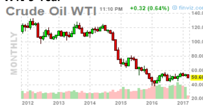
WTI 5 Year