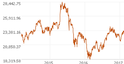
HK HSI 3 Year