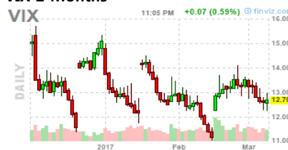
VIX 2 Months