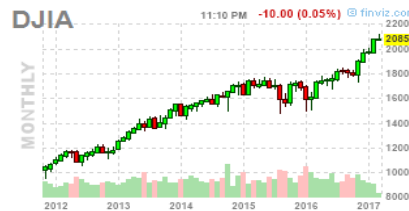
DOW 5 Year