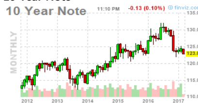
10 Year Note