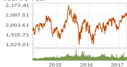
KOSPI 3 Year